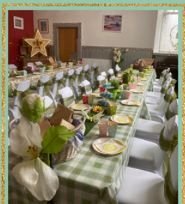
CHILDREN'S PARTY - STUDIO THREE

Have a look at some of our previous set ups below