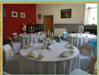
BABY SHOWER - STUDIO 3