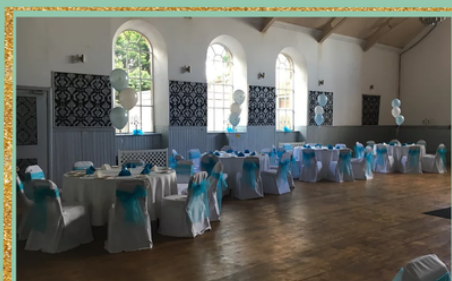
NAMING CEREMONY - STUDIO ONE