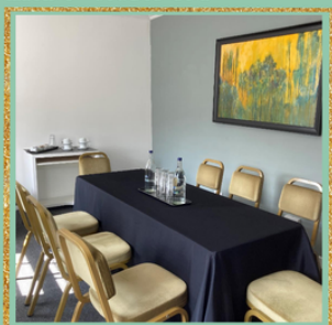
CORPORATE MEETING - STUDIO FOUR