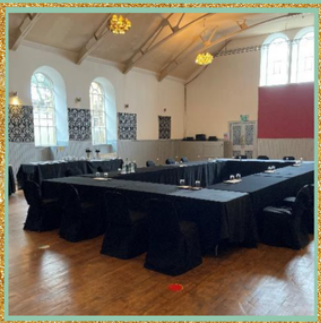
BOARD MEETING - STUDIO ONE